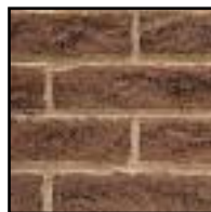
Tavern Brown firebrick