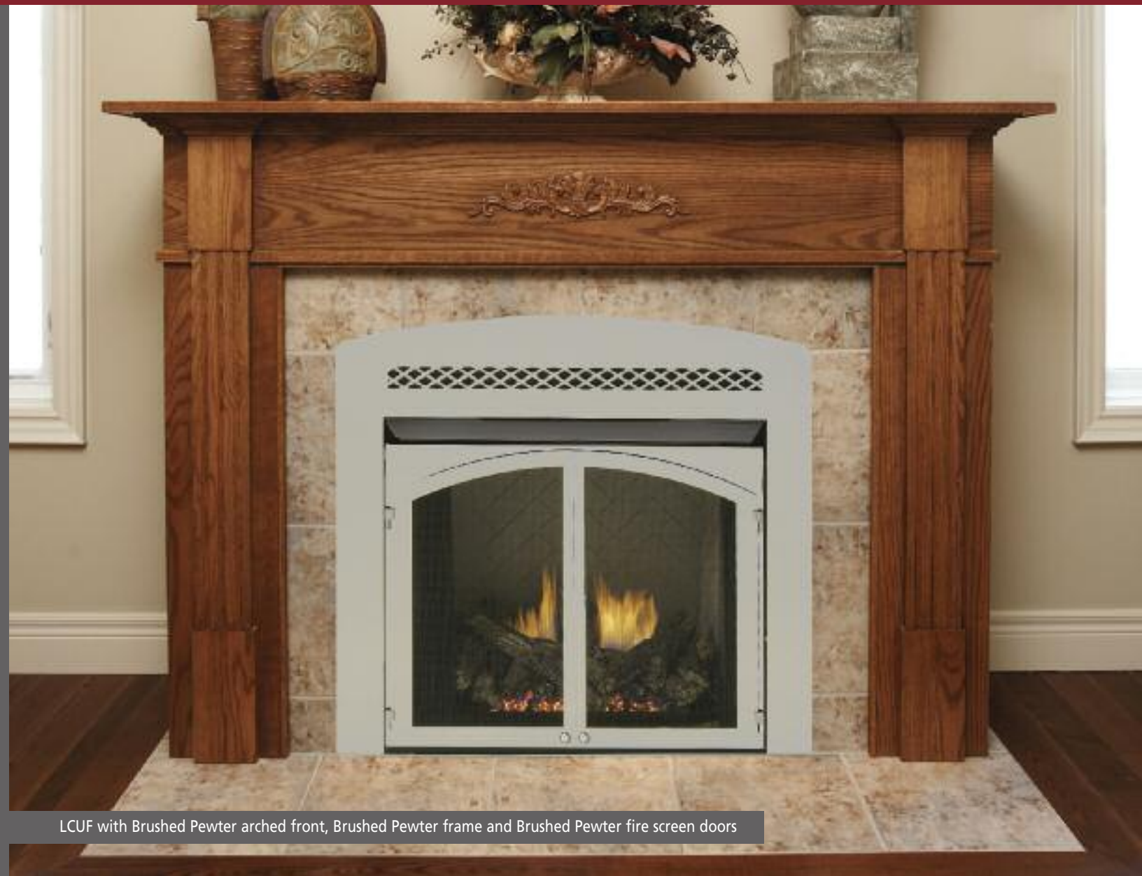
LCUF with Brushed Pewter arched front, Brushed Pewter frame and Brushed Pewter fire screen doors