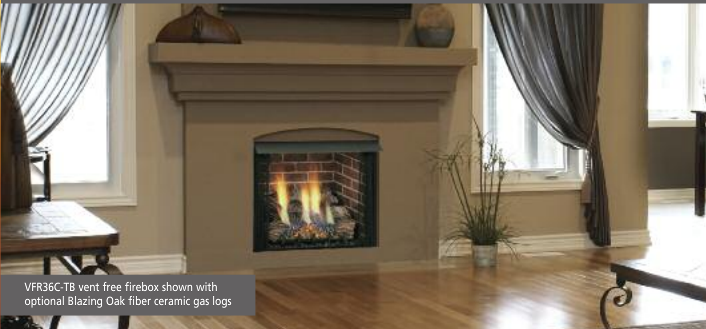
VFR36C-TB vent free firebox shown with optional Blazing Oak fiber ceramic gas logs

Give people a place to gather – make fire the focal point of your room again with a Vent Free Firebox from Majestic.