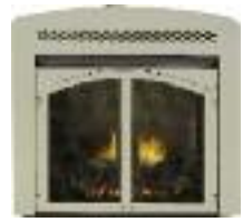
Classic faces available for VF/VFR/MCUF fireboxes