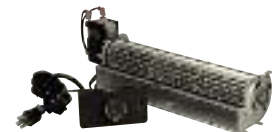
FA2 blower option for BUF fireboxes