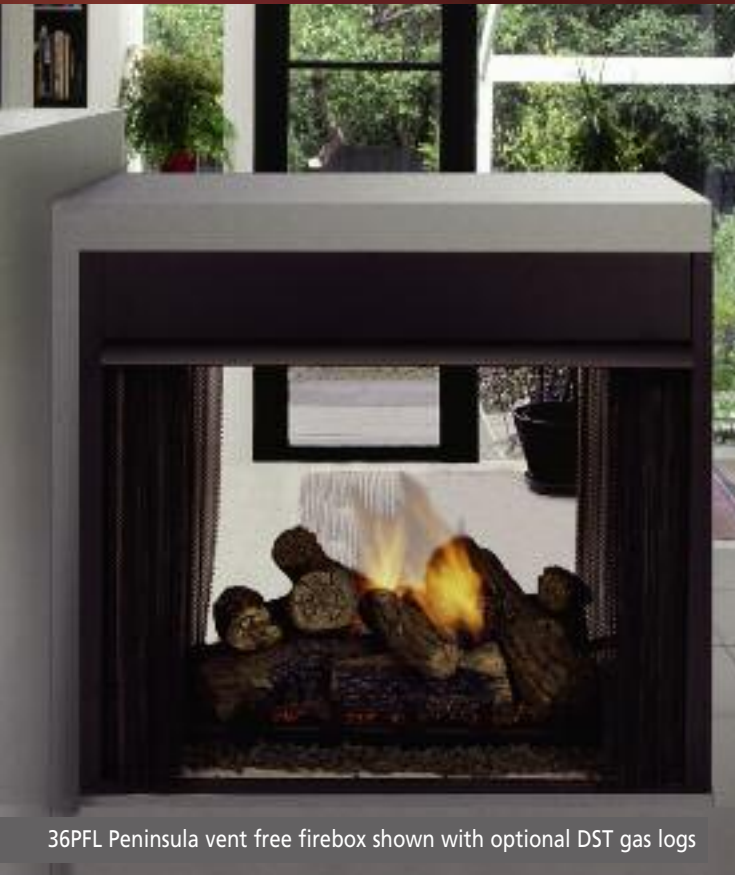
36PFL Peninsula vent free firebox shown with optional DST gas logs

Our Majestic vent free fireboxes also come in exciting designer styles that offer dynamic design applications. Available in See-Thru, Peninsula and Corner models, these sophisticated fireboxes add style and warmth to your rooms while maintaining a contemporary feel.