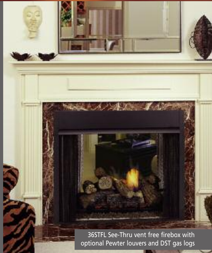
36STFL See-Thru vent free firebox with optional Pewter louvers and DST gas logs