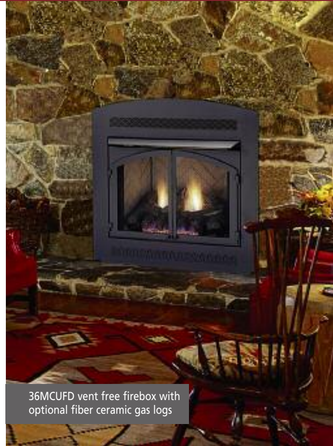
36MCUFD vent free firebox with optional fiber ceramic gas logs

The VF/R series of vent free fireboxes from Majestic offers flexibility with 3 sizes – 32, 36 and 42 inches – and the option of circulating or radiant design to suit your requirements perfectly. Available with your choice of firebrick as well as a range of optional accessories, the VF/R – series is easy to incorporate into your design requirements.