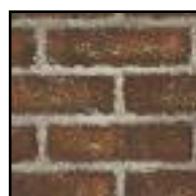
Cottage Red firebrick