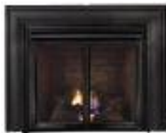
Manor faces available for VF/VFR fireboxes